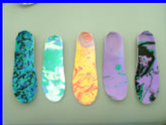
Customs orthotics fabricated using CAD/CAM computer software.

Our custom orthotics are designed based on an in-depth analysis of your biomechanics. Our highly trained Physical Therapists, who specialize in the foot/ankle and biomechanics, will develop the best custom orthotic solution for your active lifestyle. We even offer same day custom orthotics in order to get you back on your feet.